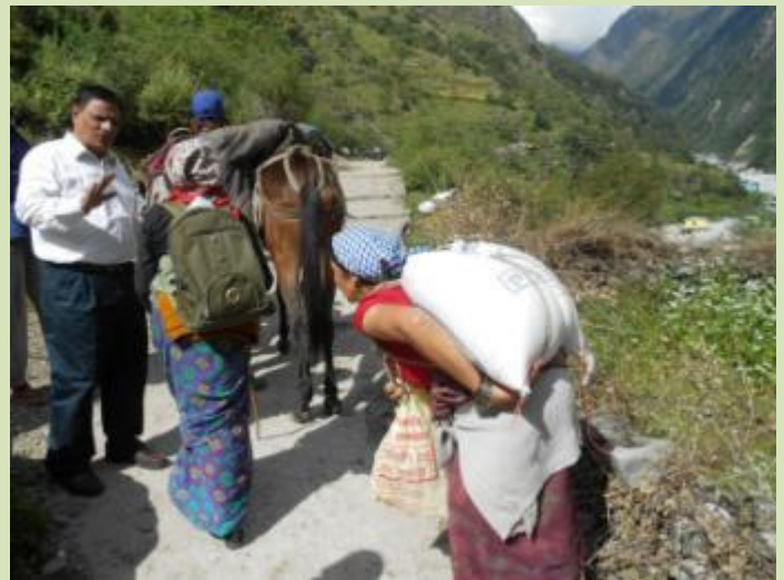
People carrying domestic consumption goods on the horse back