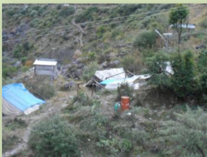
A View of Solar Street Lights Installed in a Habitation