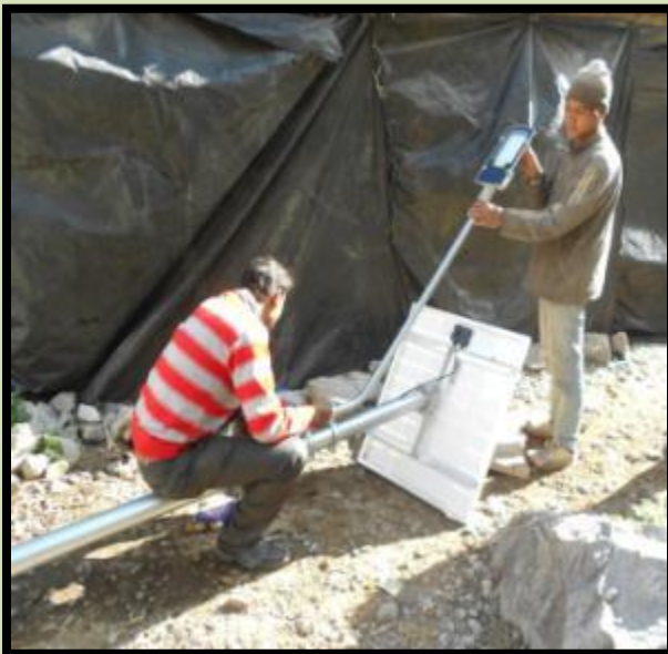
Technical Staff Preparing Solar Street Light Equipment for Installation