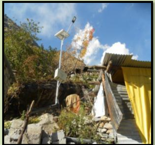
Solar Street Light Installed in the midst of houses