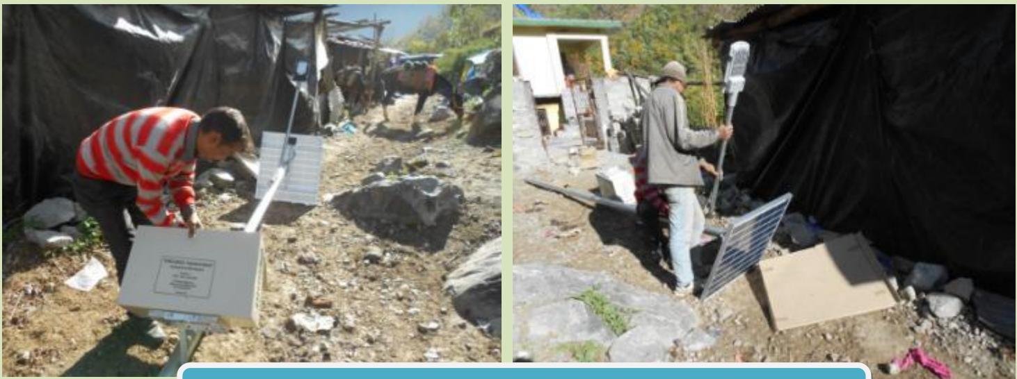
Technical Staff Assembling the Solar Street Lights Equipments