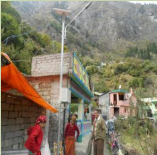
Street Light Installed in a narrow street of the village