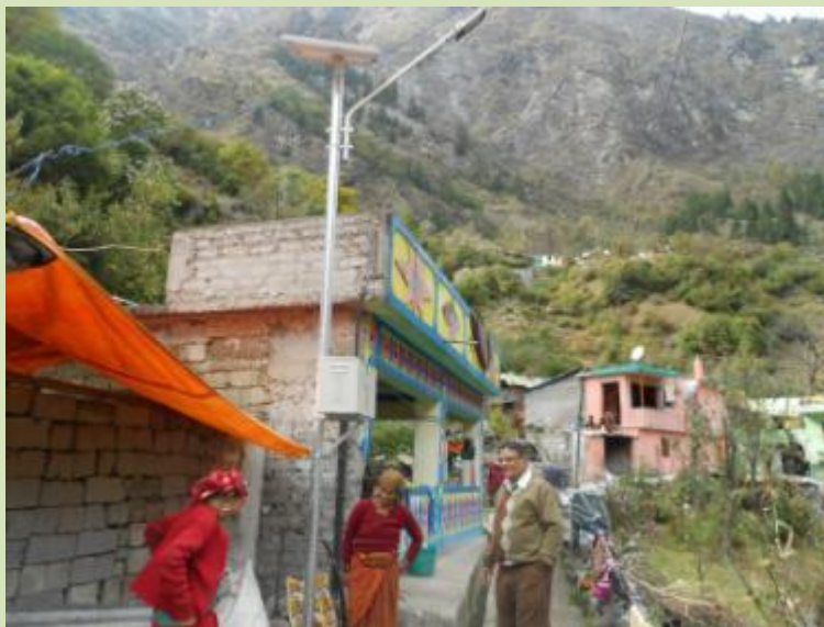
Smile on the faces of women on Installation unfailing solar street light