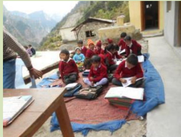
Childrens Studying on the roof top of the house