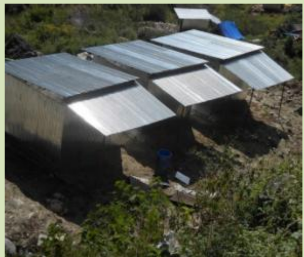
Temporary Sheds Provided by the Govt.