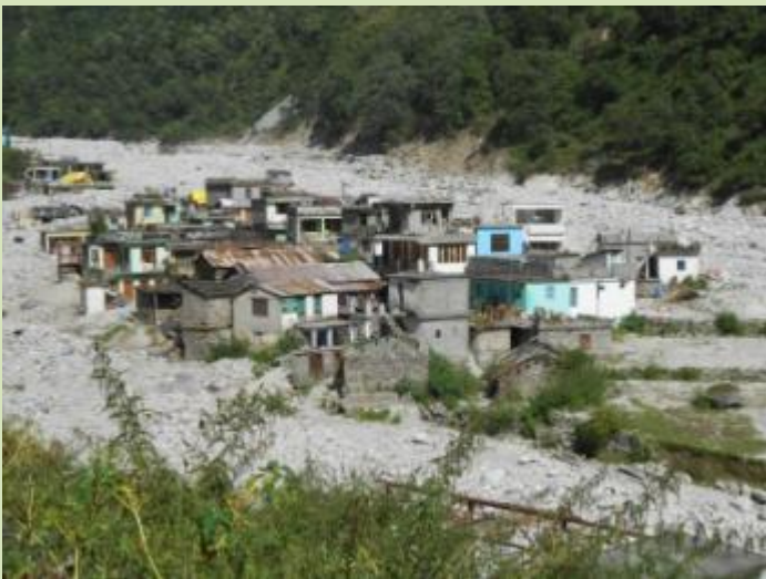
A Birds Eye View of Flood Affected Pulna Village