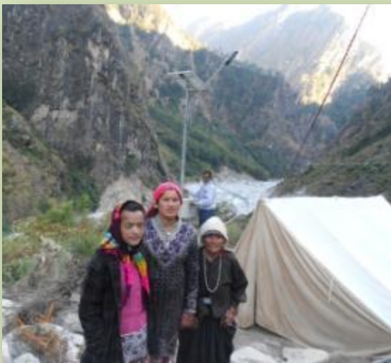
Women Expressing Happiness on Installation of Solar Street Lights