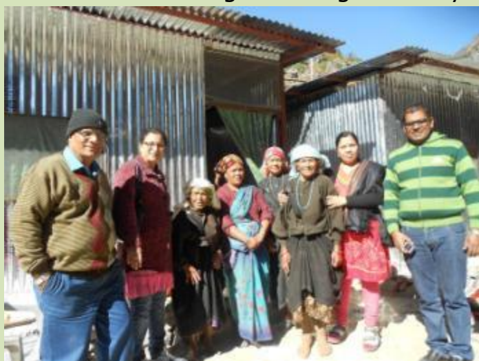
KSK - S 3 IDF Sr. Officers Interacting with SHG Women Members